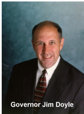
Governor Jim Doyle